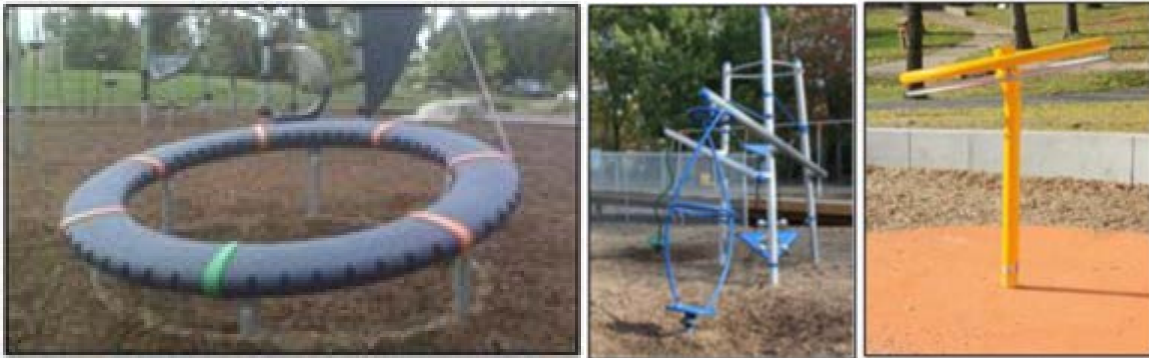
Figure 2. Examples of recently designed playground equipment shown to participants

The participants say they distrust recently designed playground equipment (Figure 2), believing the equipment to be too dangerous for children under age 5. They believe the new designs are too complicated; they see children using the equipment incorrectly and unsafely.