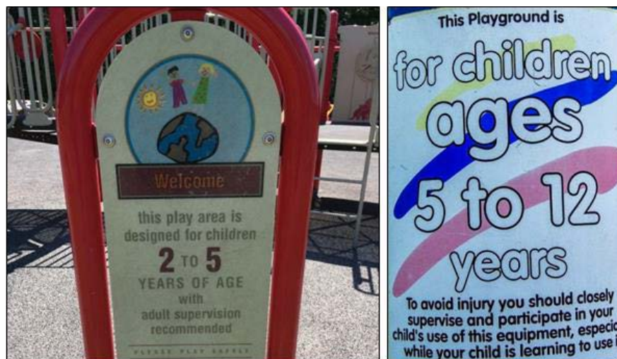
Figure 1. Two examples of playground age-recommendation labels provided to the participants by FMG.

Age-recommendation labels. Most participants report frequently seeing the age-recommendation labels at playgrounds (Figure 1). Some say they follow the labels, appreciating separation between ages, so that older children do not knock down younger children. Others ignore the labels, believing the equipment to be intuitive and/or wanting their children to explore and learn their limitations. Those participants who report ignoring the labels are more likely to allow their younger children to go to the older playgrounds with supervision, rather than take their older children to the younger playgrounds. The participants report that most of the other guardians tend to adhere to the age-recommendation labels, although some ignore the labels, especially when they bring children of mixed ages to playgrounds.