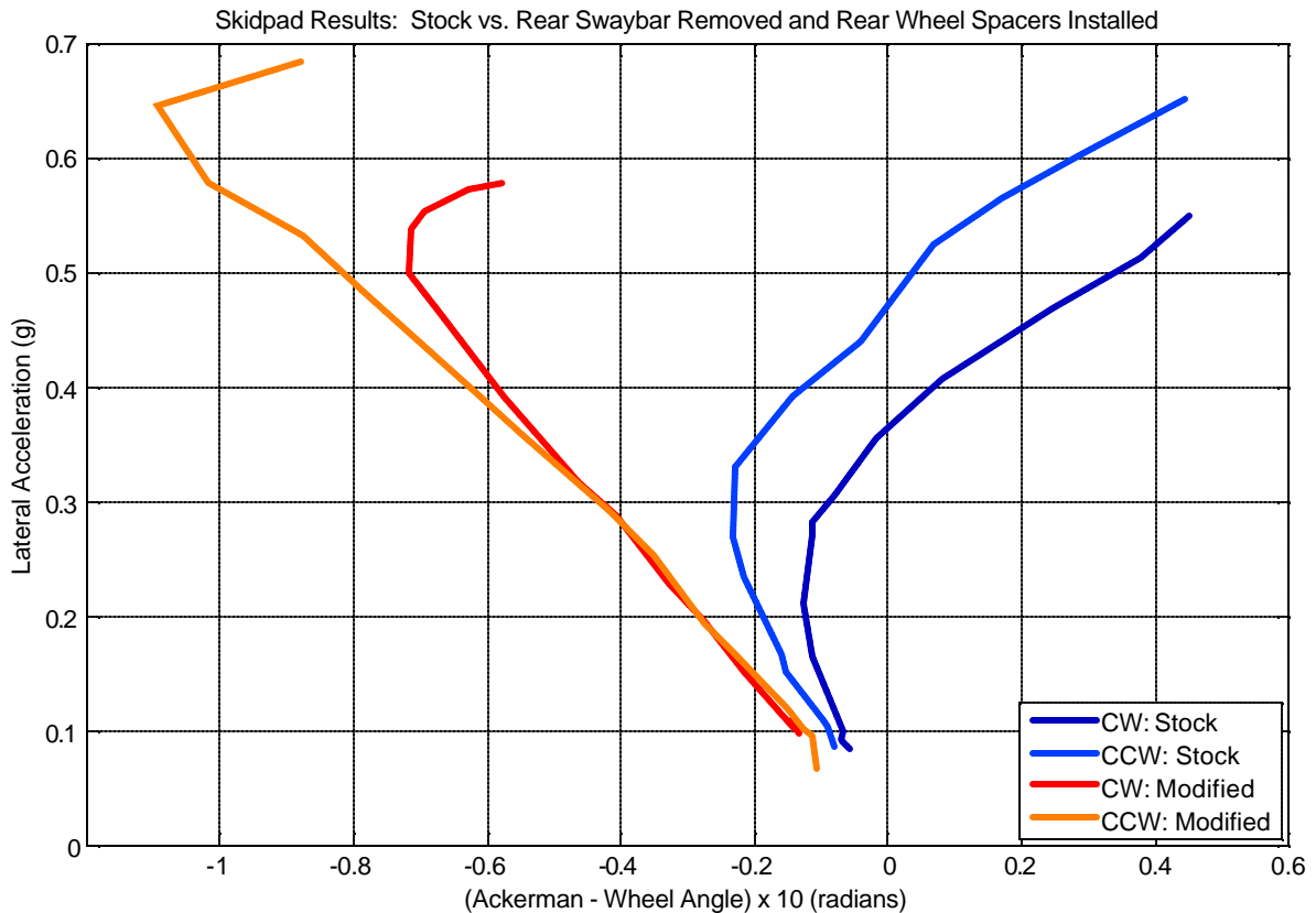
Figure 2. Steering diagram of unmodified vehicle and modified vehicle in clockwise (CW) and counterclockwise (CCW) directions.

The effectiveness of the modifications in improving the vehicle from oversteer (blue lines) to understeer (red and orange lines) is illustrated in the vehicle diagram shown in Figure 2.